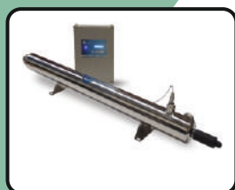
Ultra - Violet/Ozone Disinfection for Treated Water