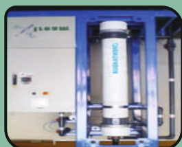
Ultra - Filtration Tertiary Treatment