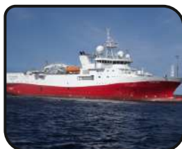
Ships & off-shore Platforms