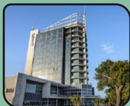
Hotels & Hospitality