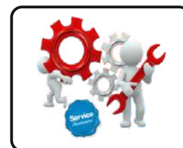
AMC and O&M Contracts

powered by Doshion PENTAAQUA Regenerating water