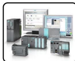
High - End Automation with Remote Monitoring in BMS